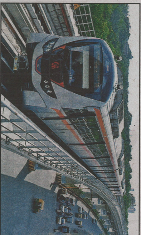
See the map of the Metro's route extension on Page 4

Even before receiving final approval from the Centre, Gujarat Metro Rail Corporation (GMRC) had initiated preparatory work, includ-