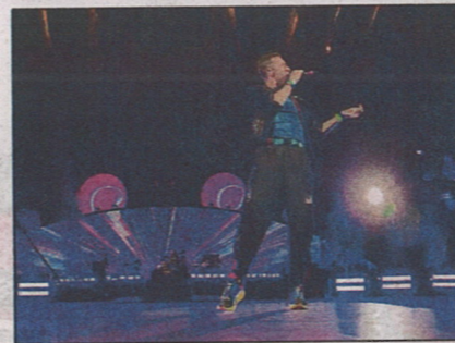
AJAJE TAME BADHA BAHU SUNDAR LAGO CHHO!

solutely thrilled to be here, and the vibe is amazing. A few friends of mine arrived from Bengaluru especially for this performance, and we expect magic when the show begins."