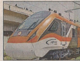
Will ply between Ahmedabad, Bhuj

Officials said the train will stop at nine stations and cover the 360km distance in 5